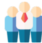
Multiple Mock Interviews with Practitioners

In addition to the activities mentioned above, Jio Institute also encourages and supports students in forming professional clubs of their areas of interest and hosting events such as career panels, hackathons, business competitions, and conferences.