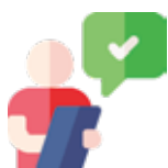
Career Expectation Survey

For students, an interview with a leading organization is a step towards working in their desired roles and launching a successful career. Conversely, an interview is a chance for an organization to learn more about students, particularly regarding their qualifications, capabilities, interests, communication skills, and the cultural fit with their organization. Students are encouraged to start preparing for their job interviews ahead of time and in a structured manner. In the broader context, a methodical and comprehensive competency building process goes beyond just ensuring success during campus placements, and helps you succeed professionally in the long term as well. The Institute uses the following tools to support the preparation phase: